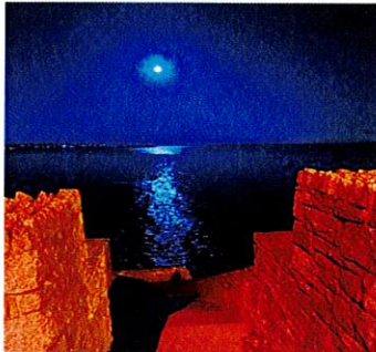
Figure 1: Cliff Walk 40 Steps by Thomas Freeman