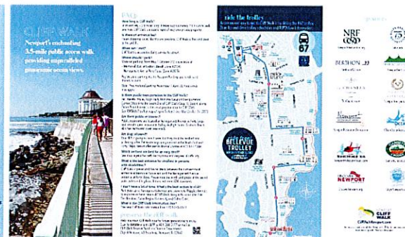
Figure 7: Cliff Walk Map - back panel