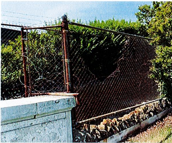
Figure 2: Rosecliff Before

Starting in 2020, the Commission has been working to eliminate all the barbed wire from the Cliff Walk. We feel the presence of barbed wire is unsightly and unwelcoming. We continued to work on this in 2023 and have made great progress - almost all of the barbed wire has been removed from the Cliff Walk.