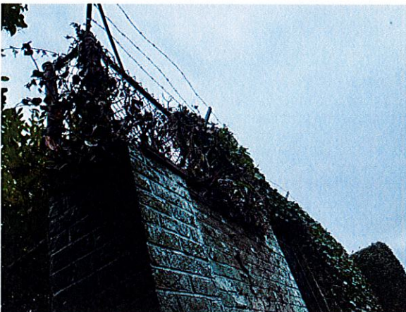
Figure 4: Seacliff Apartment Before