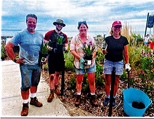
Figure 10: Maher Center garden Volunteers