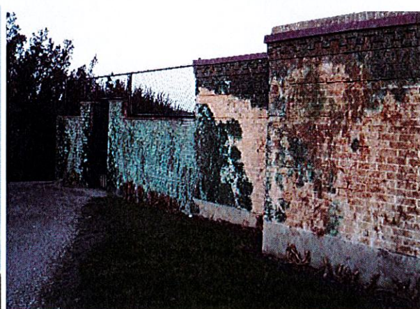
Figure 5: Seacliff Apartment After