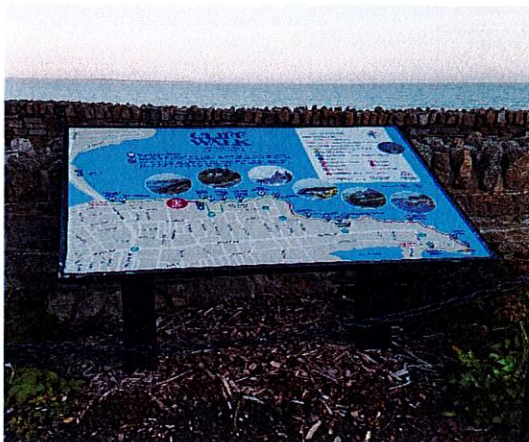
Figure 8: Wayfinder at 40 Steps

The Cliff Walk has 8 Wayfinder signs that provide information to visitors on the Cliff Walk. They were outdated and needed to be replaced to provide information consistent with the new printed maps, and to show the location of the detour at 40 Steps and Webster St. (in place due to the slope failure). The new Wayfinders were fully funded by Discover Newport and installed by the City of Newport.