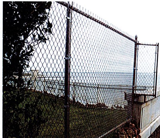
Figure 3: Rosecliff After