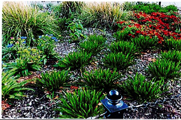
Figure 11: Garden at 40 Steps