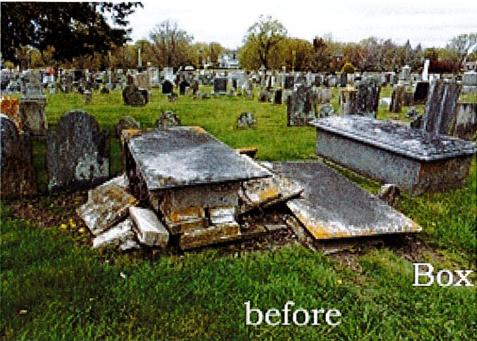
Box tombs before