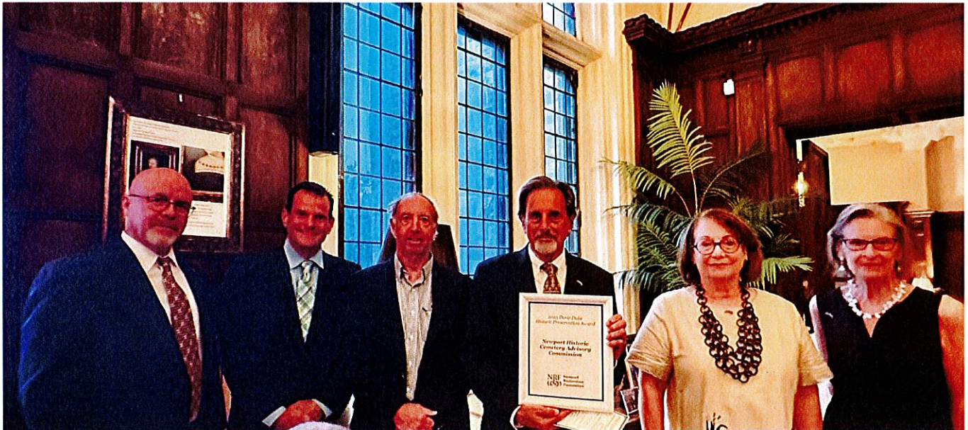
The commission was honored to receive a 2023 Doris Duke Preservation Award from the Newport Restoration Foundation.

The commission is very appreciative of the support of the City Council and staff.